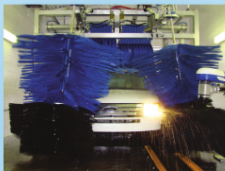
'Porter Proof' side wash wheels are "Built to Tilt"™ through a full 360°, using a patented oversized socket joint