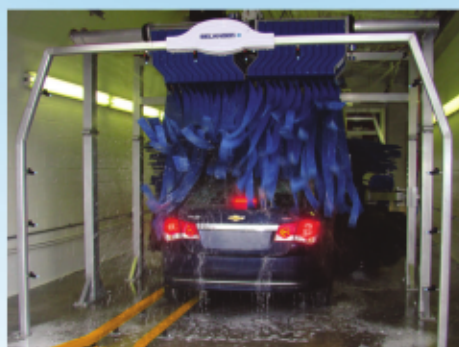
The Quad Wave Mitter™ washes vehicle fronts, tops & backs – for a full-size clean in only 7 feet of bay space