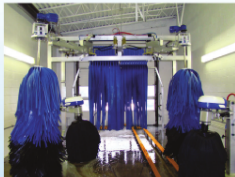
The insta-KLEEN™ fits into bays as short as 25 feet – even an existing service bay, for maximum flexibility